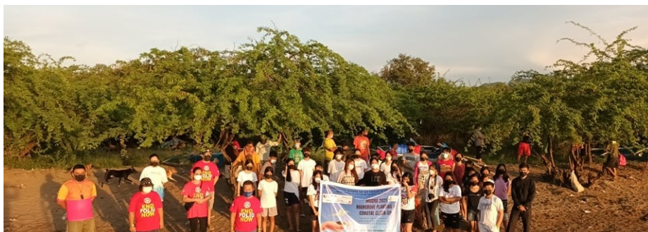
Rotary Club of Cebu Naga Central and the Parish Youth Coordinating Council during the coastal cleanup and mangrove planting last October, 2021 in South Poblacion, Naga, Cebu

been supported by the Rotary Club of Cebu Naga Central, Apo Cement Corporation (CEMEX Philippines) and the Barangay South Poblacion. In the past 6 years, it is the venue for the district-wide mangrove planting participated by areas within Metro Cebu. Mangroves are trees and shrub species that grow at the interface between land and sea in tropical and subtropical regions of the world, where the plants exist in conditions of salinity, tidal water flow and muddy soil.