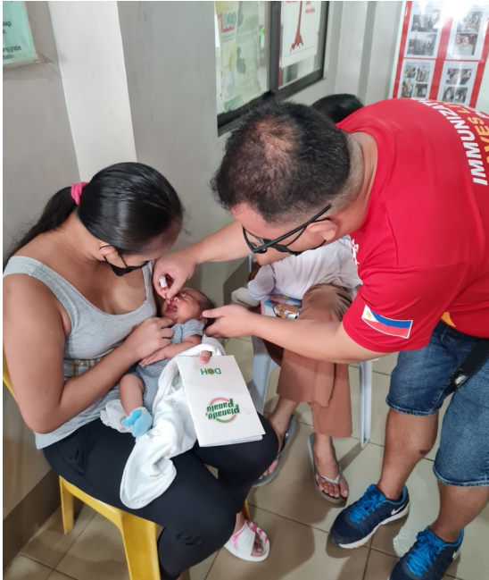
RCCNC President drops the oral polio vaccine to an infant in Brgy. Tuyan, Naga, Cebu

The Official Club Bulletin of the Rotary Cebu Naga Central (RCCNC)